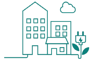
Customer You and Your Community

SCE delivers the power, maintains the lines, and reads your meter